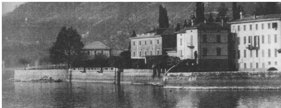
The small port in the early 20th century and as it is today

The small port in Moltrasio, simply called "dock" by the inhabitants, always has been - and still today is - an important reference point for tourism in the village, contributing to embellish Moltrasio and to enhance its visibility.