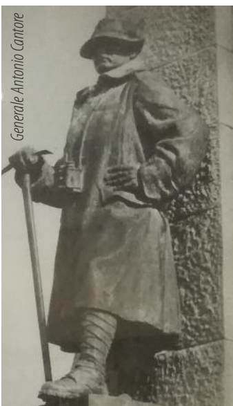
Generale Antonio Cantore